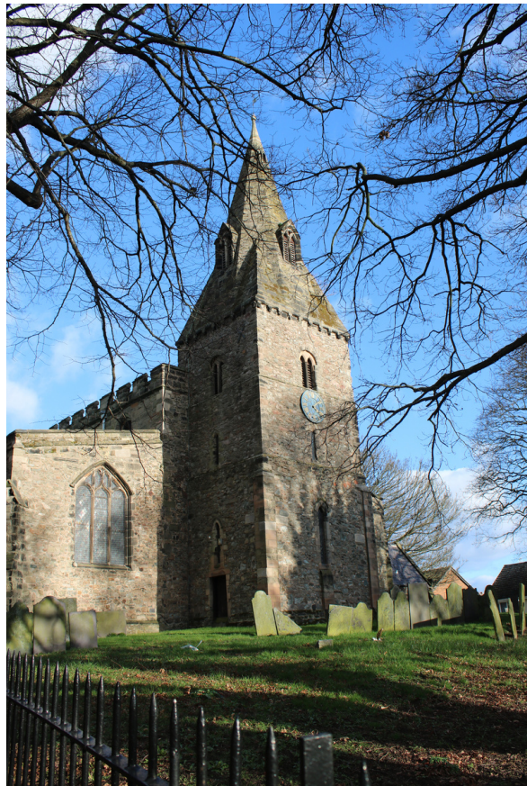
St Botolph's Church: the oldest surviving part of the church, the west tower and spire, dates from the 13th century.

The retail outlet, Armstrong Mill, is situated on the main road through the town.